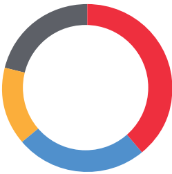
North American Facilities Premium by Class 2010